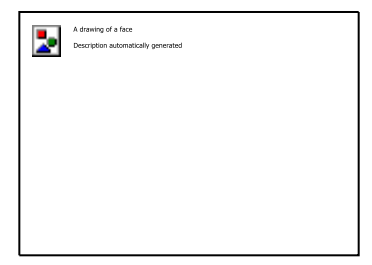
CGLA DISCIPLINE PLAN

A safe and orderly school starts with student code of conduct and a fair and consistent application of consequences. The CGLA discipline plan includes a daily classroom behavior management plan that each teacher may use to maintain safety and provide equal opportunities for all children to learn. Teachers may create their own daily classroom management plan.